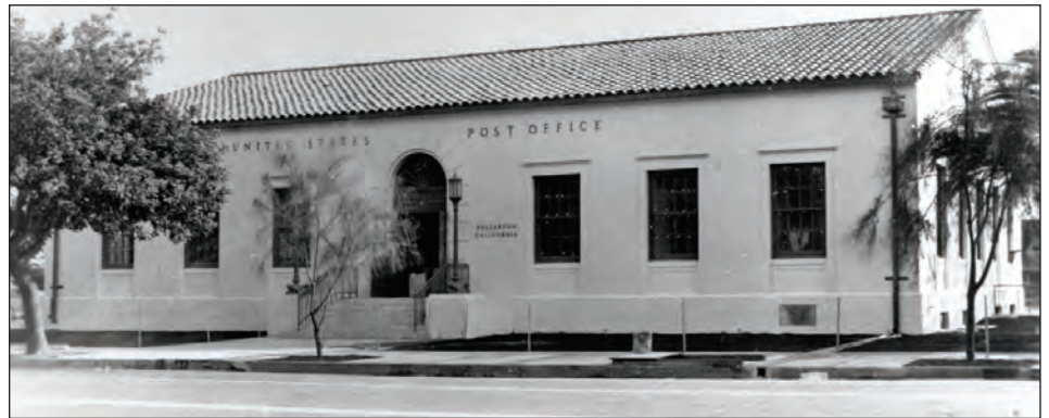
The Commonwealth Post Office in October 1939, one month before it opened.