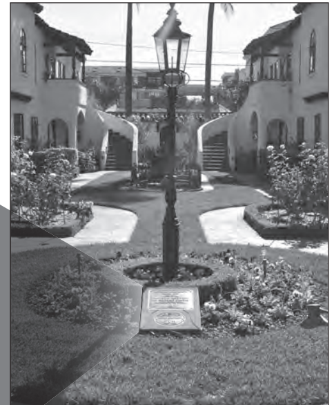
The new National Register plaque has a place of honor in front of the Dewella Apartments.